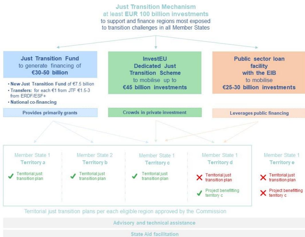
Figure 4. Financing the Just Transition Mechanism

Each pillar will assist with different grant and financing instruments in order to offer a full range of support options in line with the needs to mobilise investments benefiting the most impacted regions. To ensure coherence between the three pillars, the Just Transition Fund will be used to provide primarily grants; the dedicated transition scheme under InvestEU will crowd in private investments, and the new just transition public sector loan facility will leverage public financing. These measures will be accompanied by dedicated advisory and technical assistance for the regions and projects concerned. The Just Transition Mechanism will include a strong governance framework centred on territorial just transition plans.