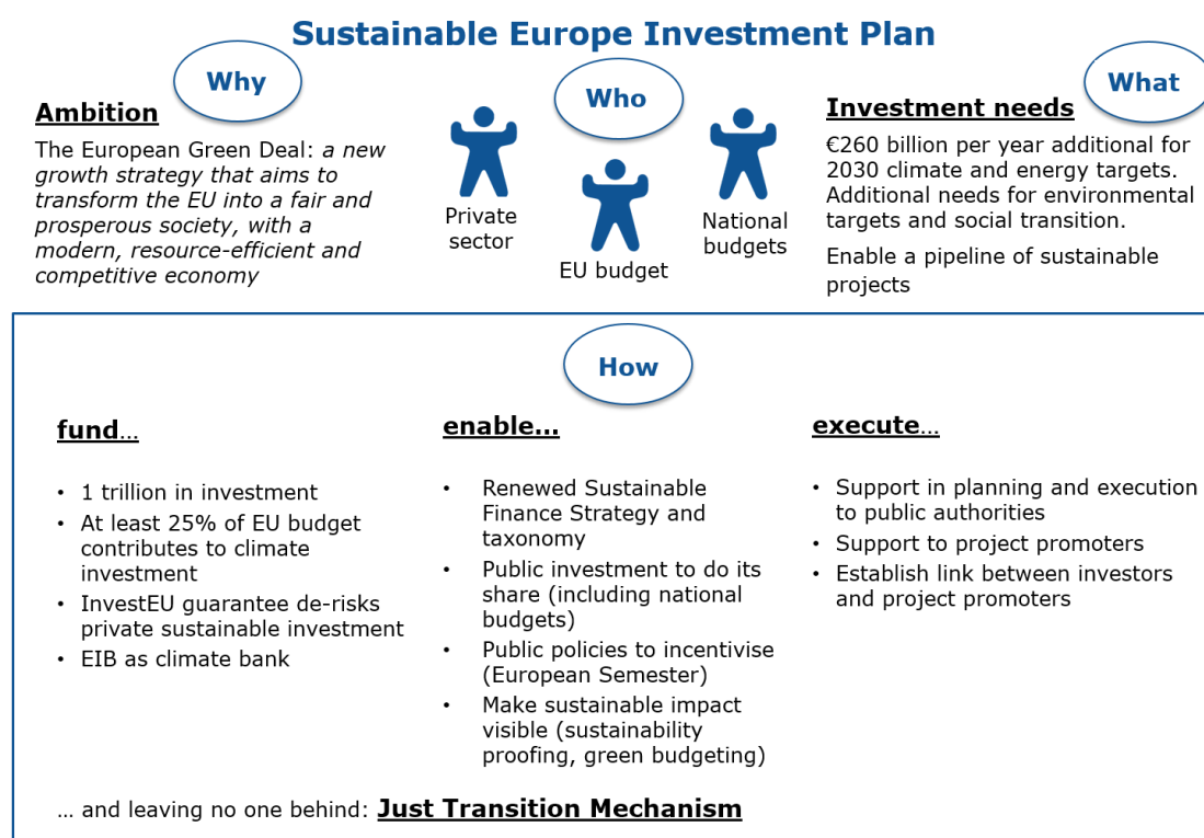
Figure 2. The Sustainable Europe Investment Plan

The Sustainable Europe Investment Plan contributes to the implementation of the Sustainable Development Goals. This is consistent with the commitment, in the European Green Deal Communication, to put the Sustainable Development Goals at the heart of the EU’s policymaking and action.